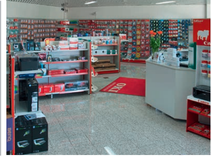
Indoor air quality