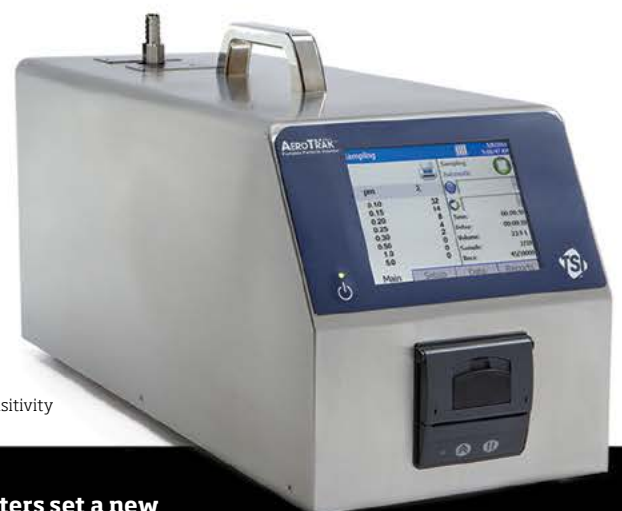
Model 9110 0.100 \mu\text{m} Sensitivity

AeroTrak Portable Particle Counters set a new standard for your everyday certification needs.